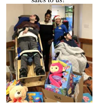
The Northport Running Club hosted a toy drive and donated them to us for our Holiday Parties!