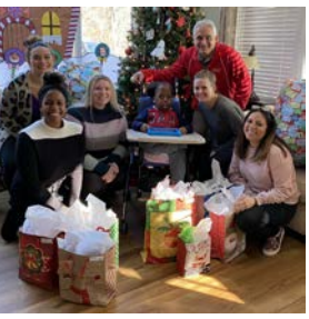
KidsShoes.com sponsored all the children at our homes and bought them personalized holiday gifts!