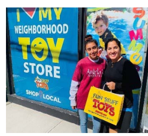
Fun Stuff Toys in Seaford donated a day's sales to us!